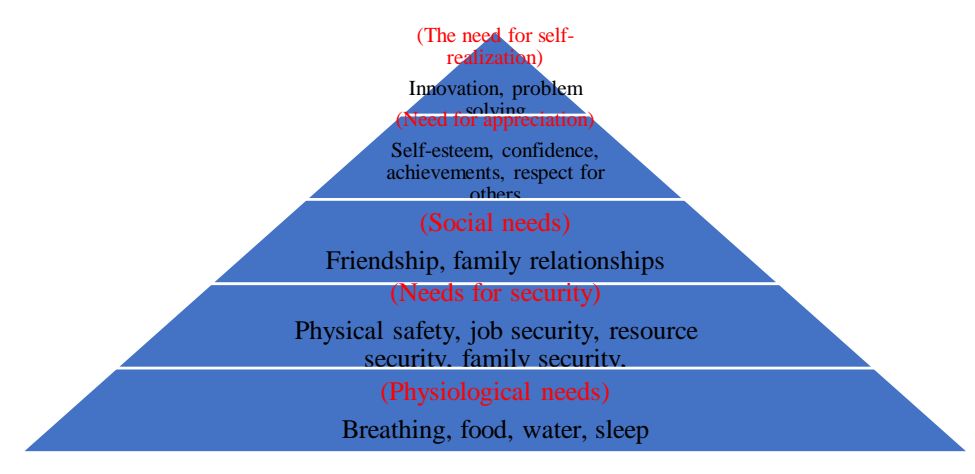
Maslow's Theory of Human Needs, Figure (2)

pyramid with different levels. Maslow identified five levels, its base is the basic needs, which are represented by (physiological and security needs), and at the top of the pyramid are represented by (social needs and self-esteem; self-realization) as shown in the Figure (2) (Hershberger, R.G. 1999) [8].