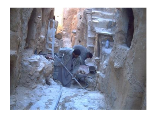
Figure (4): Residents are examining and restoring Nalut Palace

From the above, the role played by the people in the restoration work of the palace in the city of Nalut, and their basic incentives is palace permanency and reuse it. In addition, the spirit of belonging to the local identity and love of the beauty of heritage and its preservation and permanency.